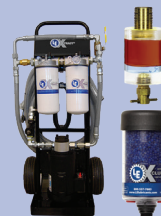
Contamination Exclusion & Removal