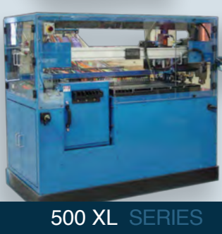
500 XL SERIES