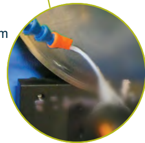
wet cut system