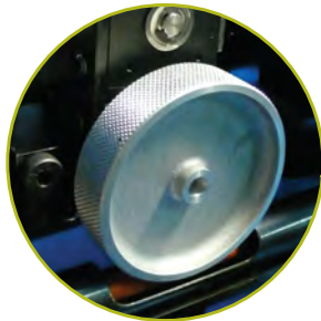
independent measuring system