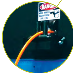
adjustable material guide