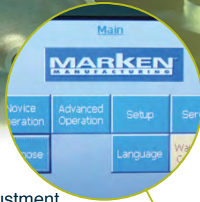
touch screen with auto adjustment