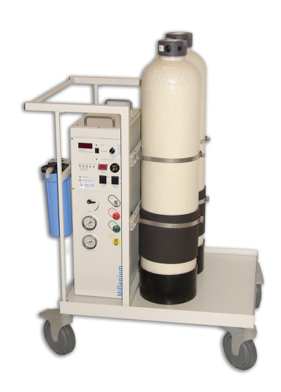
Current Cart Design

At this time, in order to achieve 10 minute EBCT, most users utilize 2 carbon filtration beds in series using an exchangeable carbon vessel holding from 0.66 to 0.85 cu. ft. of carbon media (depending on the RO flowrate and recovery), which weighs between 200-300 lbs. This