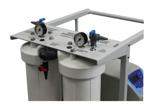
PTG-520 Carbon Filtration System

The specific regulations pertaining to the use of carbon are detailed in ANSI/AAMI RD52:2004 and specifically Amendments 1-3, Annex's C, D, and E that have been adopted by CMS. In the document, the regulations state that "where practical" two