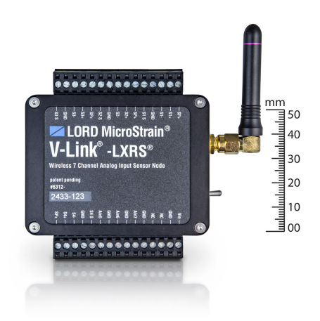
V-Link<sup>®</sup>-LXRS<sup>®</sup> - versatile seven channel analog sensor node with high sample rates and datalogging capability

LORD MicroStrain<sup>®</sup> LXRS<sup>®</sup> Wireless Sensor Networks enable simultaneous, high-speed sensing and data aggregation from scalable sensor networks. Our wireless sensing systems are ideal for sensor monitoring, data acquisition, performance analysis, and sensing response applications.