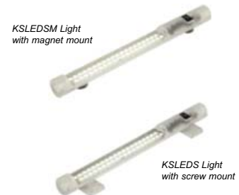
KSLEDSM Light with magnet mount