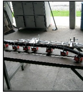
Cutting a radius using a triple (3D) plane rail