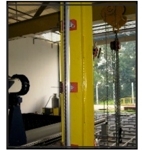
Straight cutting on aluminum rail using a single (1D) plane rail