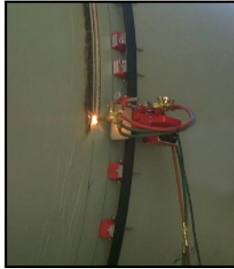
Curved cutting using a double (2D) plane rail