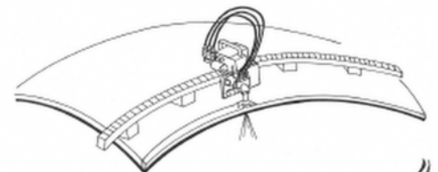
Using a triple-plane curved rail