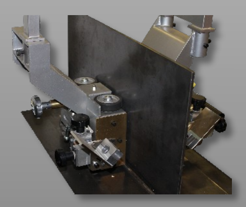
Drive wheels and sub-carriage rollers

The arm of the Wel-Twin is engineered to be suspended from a gantry system. While the Wel-Twin is suspended and moved downward the carriage grips the vertical plate with a magnetic force. Once the weld is made the carriage is lifted out of the way. This allows for multiple units to be run by a single operator.