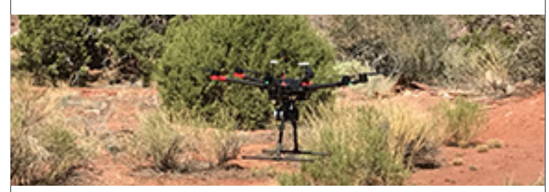
Fully integrated, fully tested airborne solutions for a wide range of remote sensing applications.