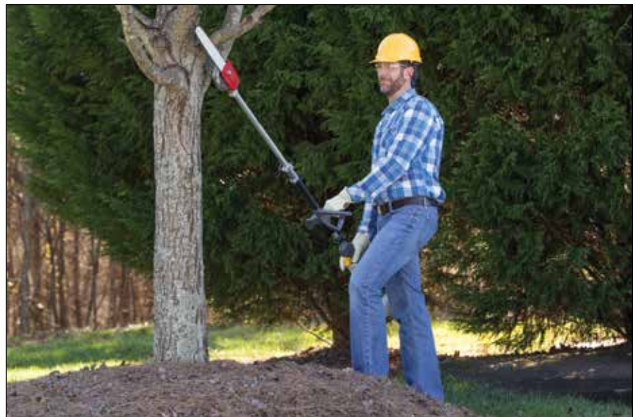
Right: Honda UMC435 and SSPP Pruner Attachment

UMC powerheads are comfortable to use even for long periods of time thanks to our anti-vibration system of a rubber mounted shaft between the shaft and clutch.