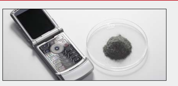
Mobile phone keypad: Grinding results after embrittlement under freezing conditions

For comminution of individual electronic components, such as mobile phones for RoHS analysis, the FRITSCH Vibratory Micro Mill PULVERISETTE 0 delivers very good results – depending on the sample characteristics at room temperature or with cryogenic grinding after embrittlement with liquid nitrogen in the practical FRITSCH cryo-box.