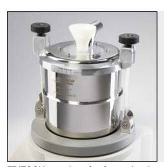
FRITSCH cryo-box for fast, simple embrittlement

The FRITSCH PULVERISETTE 0 is the ideal laboratory mill for fine comminution of medium-hard, brittle, moist or temperature-sensitive samples – dry or in suspension – as well as for homogenising of emulsions and pastes.