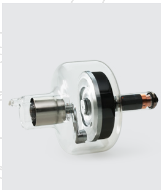
Brazing of X-ray target parts