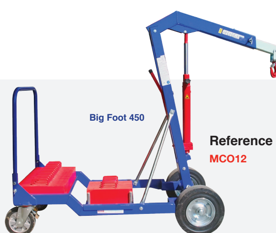
Big Foot 450