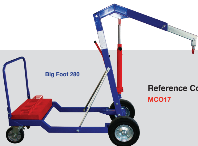
Big Foot 280