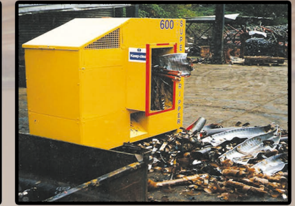
Electric pendant control for cable size adjustment, forward/reverse emergency stop.

All models include oversized feed rollers with teeth quenched, tempered & designed for intensive work with cables. SS170 includes slitting blades for top/bottom cutting and parting wedge knife.