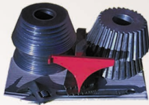
SS170 parting tool, drive wheels & slitting knife assembly