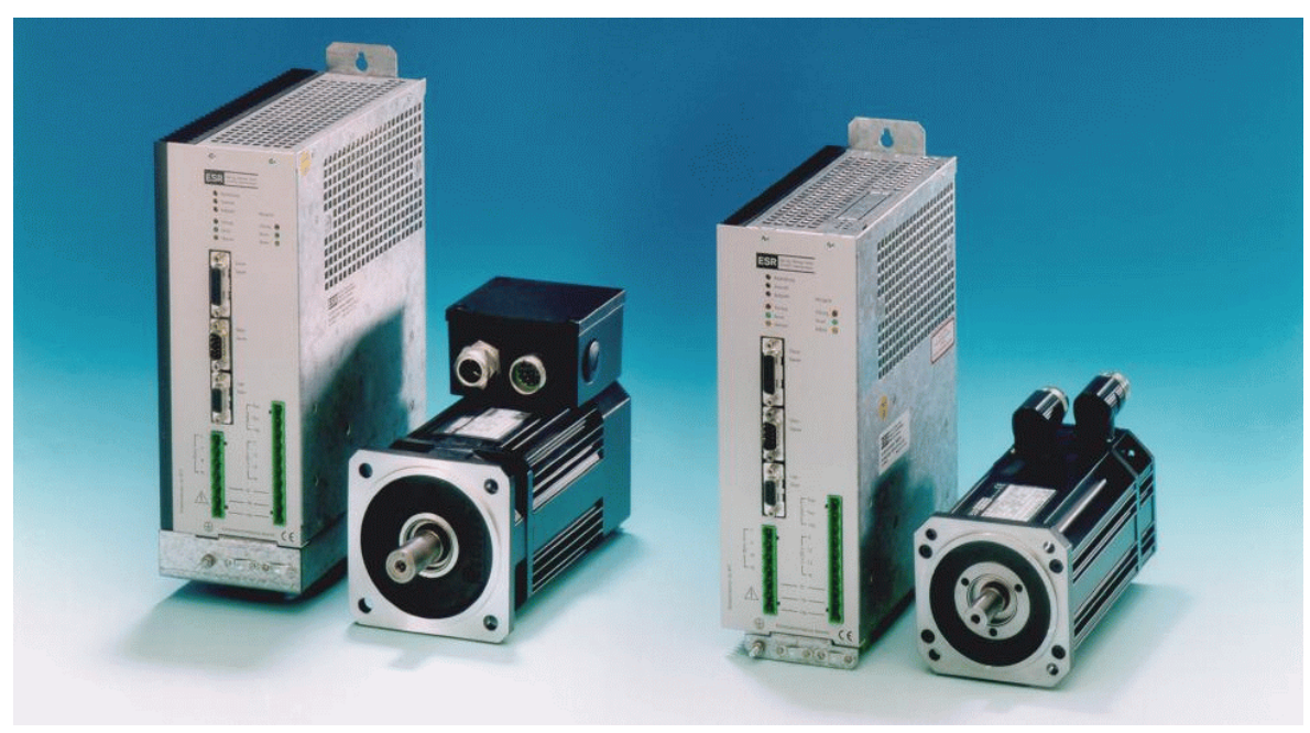
Servo amplifiers in compact design BN 6669 (12 A) and BN 6663 (3 A), motors MR 4

Analog AC servo drives with sinusoidal commutation Servo amplifiers in compact or 19" design, 6 height units Servo motors with high power density up to 12 Nm / 2.6 kW