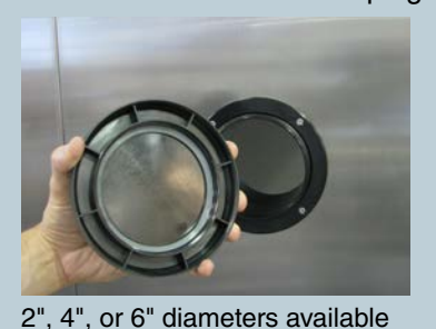
Viewing window with light