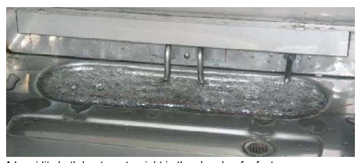
A humidity bath heats water right in the chamber for faster response, and is easier to maintain than traditional steam generators.