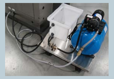
System has a recirculation mode and holds 5 gallons

Remote environmentally conditioned air (ECA)