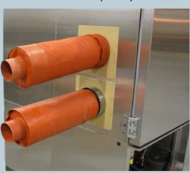
14 & 32 cu. ft. models can be modified to supply conditioned air to a remote chamber

Remote environmentally conditioned air (ECA)