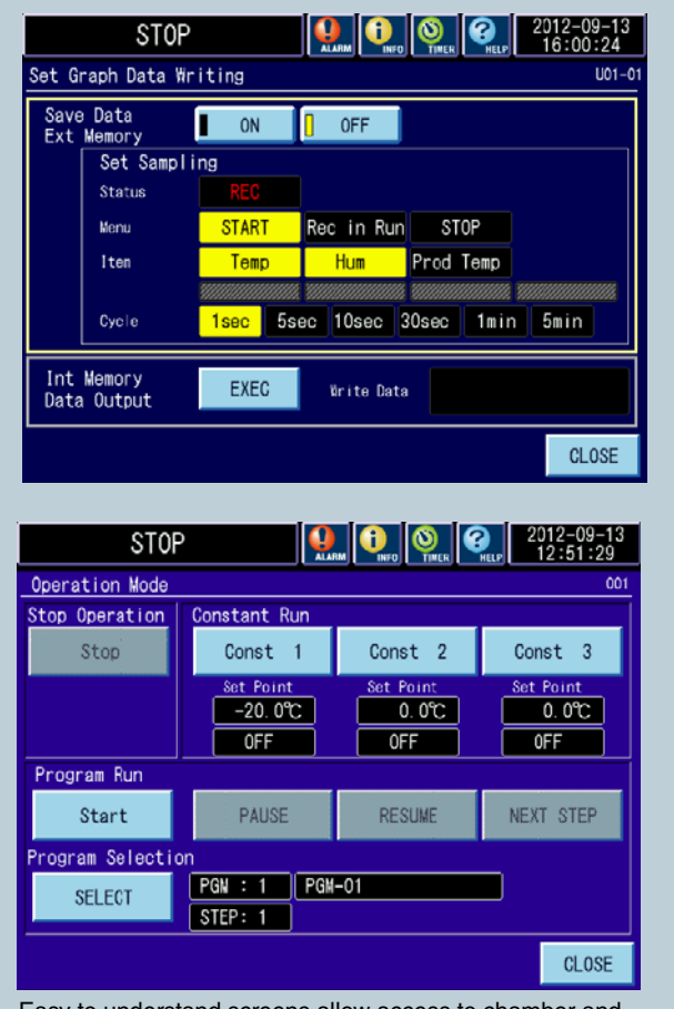
Easy to understand screens allow access to chamber and test configuration settings. The P-300 now can save three different constant setups, as well as 40 test programs.