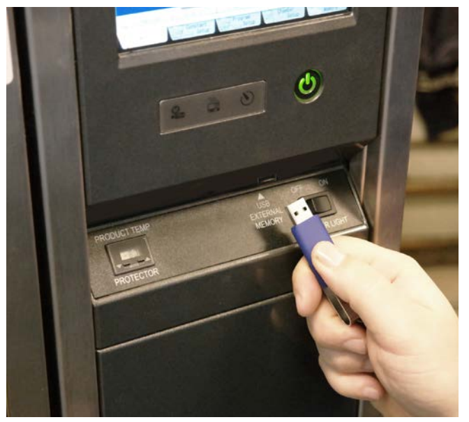
New: Upload and download programs via USB thumb drive.