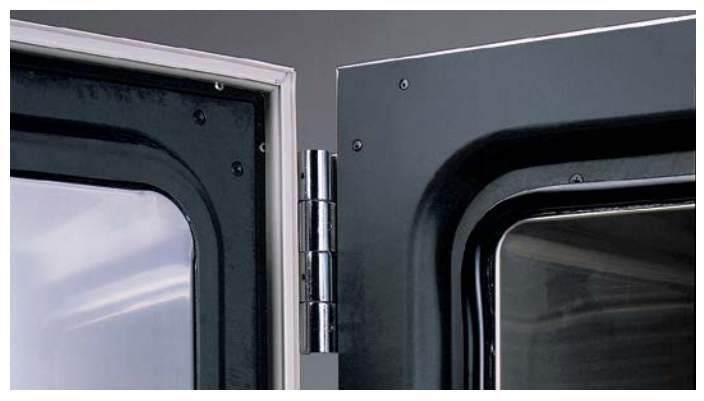
Rounded interior corners and black resin thermal breaks around the door and doorframe are unique features found only on ESPEC chambers.