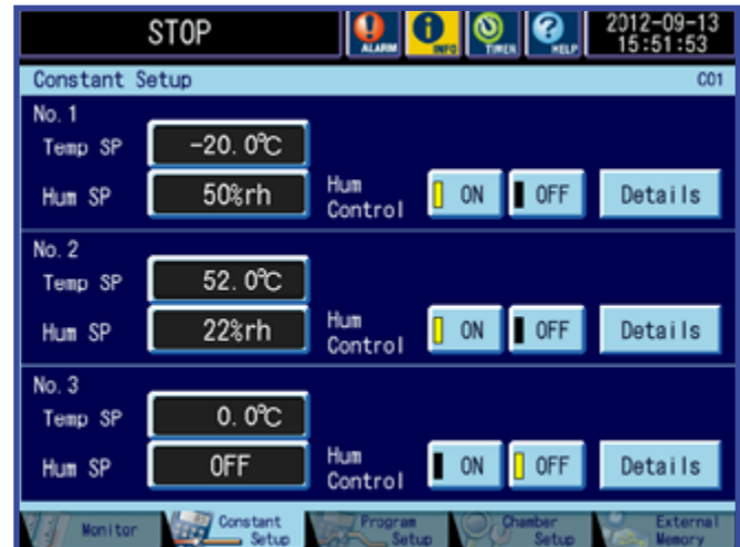
New: Three constant modes can be saved