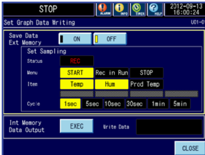
New: Built-in datalogging and export to USB