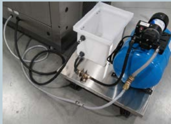
System has a recirculation mode and holds 5 gallons