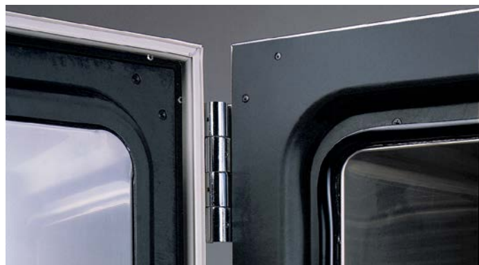
Rounded interior corners and black resin thermal breaks around the door and doorframe are unique features found only on ESPEC chambers.