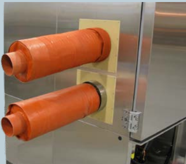
14 & 32 cu. ft. models can be modified to supply conditioned air to a remote chamber