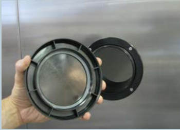
2", 4", or 6" diameters available