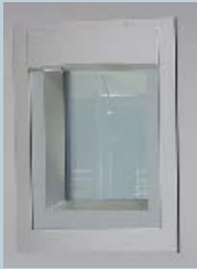
8 & 14 cu. ft.: 9" x 10.3" window 32 cu. ft.: 17" x 10" window