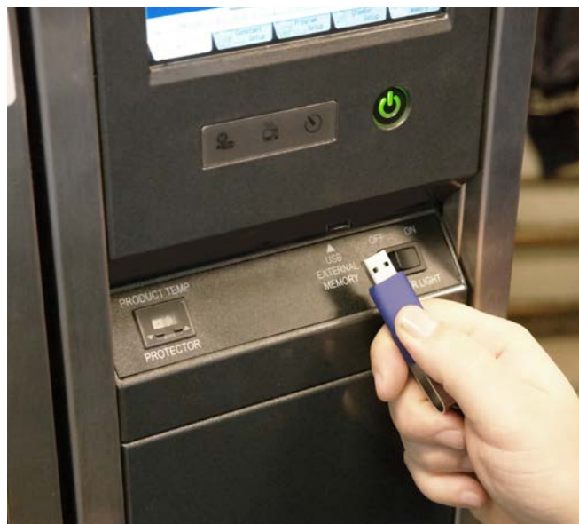
New: Upload and download programs via USB thumb drive.

Easy to understand screens allow access to chamber and test configuration settings. The P-300 now can save three different constant setups, as well as 40 test programs.