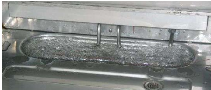
A humidity bath heats water right in the chamber for faster response, and is easier to maintain than traditional steam generators.