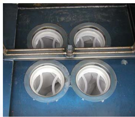
4 Filters in place