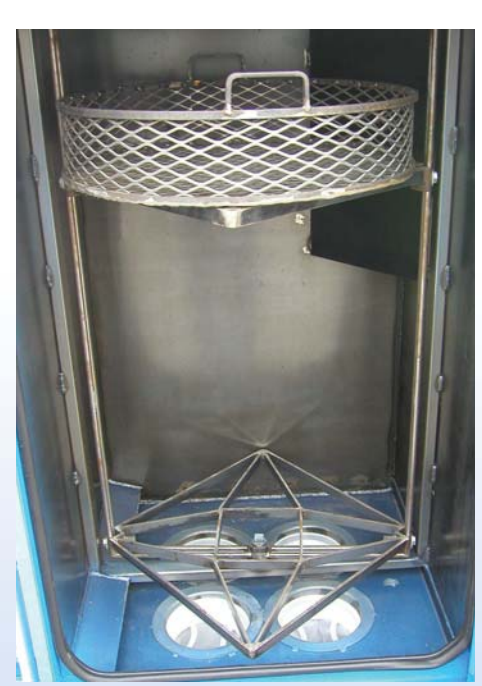
Limitless loading combinations

14930 Marquardt Avenue = Santa Fe Springs, CA = 90670 = U.S.A. (888) 833-9000 = (562) 623-9394 = Fax (562) 623-9342 www.equipmentmanufacturing.com