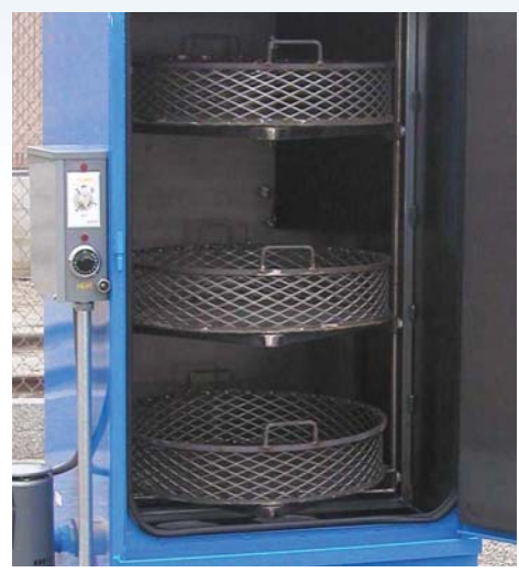
3 turn tables with baskets