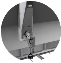
Automatic resin application