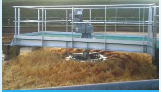
BSK®-Turbine Ø 1.400 mm, Cheese factory, France

It is well known, that the aeration system of a wastewater treatment plant is the largest power consumer on site. Consequently, it is important to reduce the energy consumption to the lowest possible level. As a result, the efficiency of aeration systems is an important matter concerning the long-term energy balance. BSK®-Turbines play an important part in fulfilling this objective.