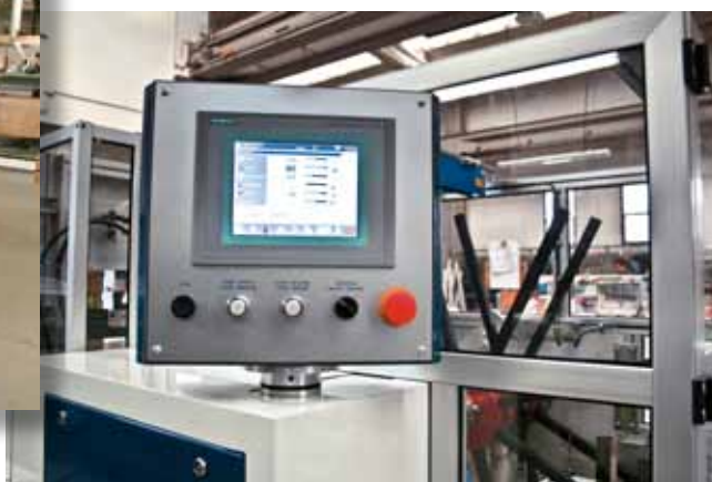
• Coloured Siemens 8" LCD Touch Screen