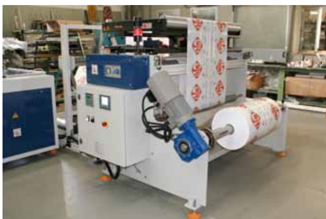
• Motorized Un-winder unit