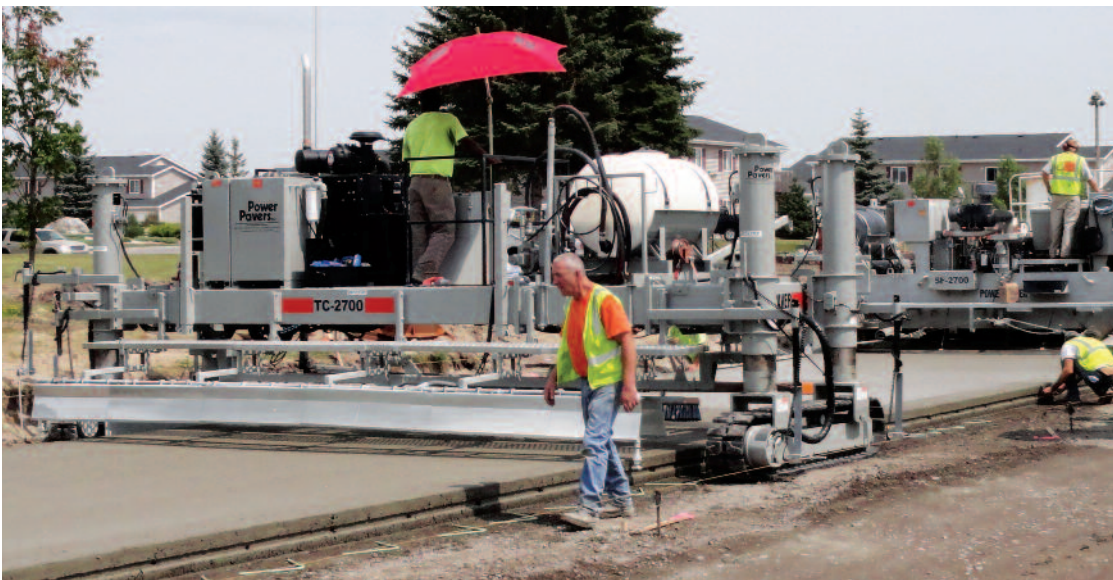
TC-2700 texture/curing machine following an SF-2700 paver.