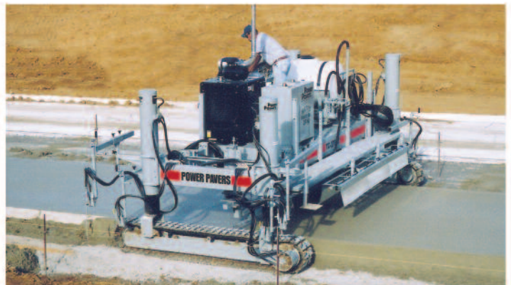
▲ Power Pavers TC-2700 Texture/Curing Machine