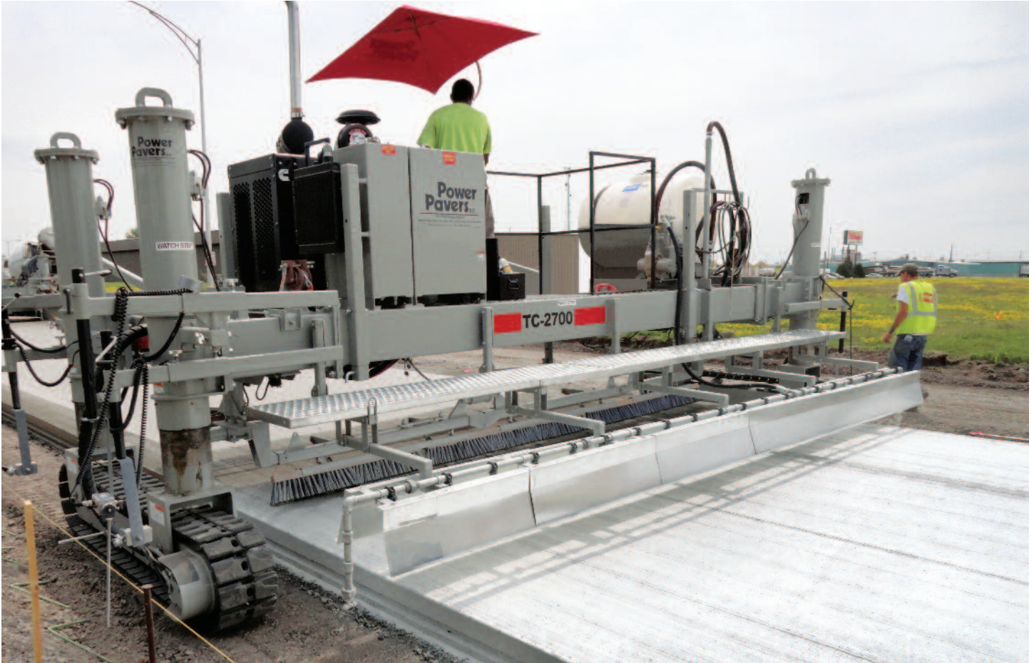
TC-2700 in North Dakota applying a broom finish and spraying curing compound onto the new paving.

The Power Paver TC-2700 is your choice for smooth, straight grooves and consistently sprayed curing compound across the slab and along the sides. The robust machine provides a stable platform for the tining system. This, and a smooth propel system through all speed ranges, make the TC-2700 the best all around texture/curing machine on the market.