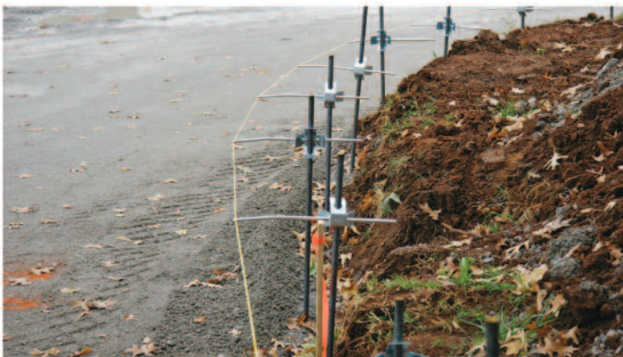
▲ Anvil American Stringline Accessories