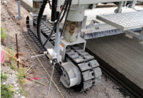
Applying a longitudinal broom finish.