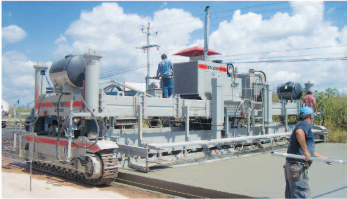
▲ Power Pavers SF-1700, SF-2700 and SF-3000 Slip-Form Pavers