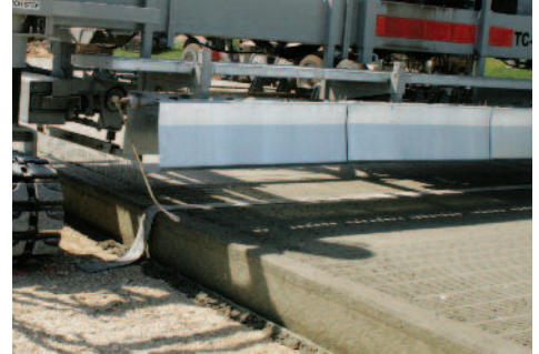
Applying a transverse tining finish.