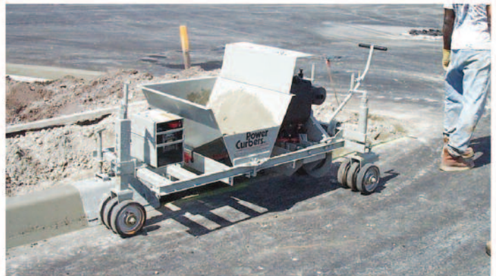
▲ Power Curbers Extruded Curb Machines