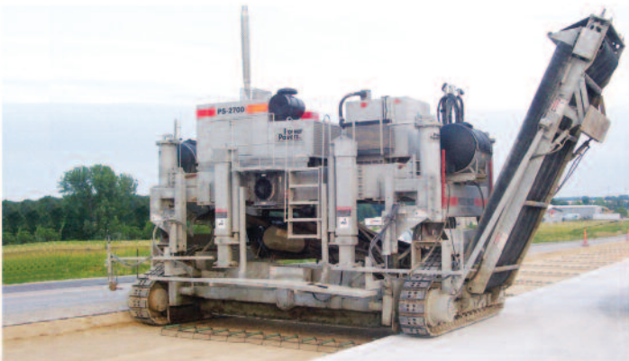
▲ Power Pavers PS-2700 and PS-3000 Belt Placer/Spreaders