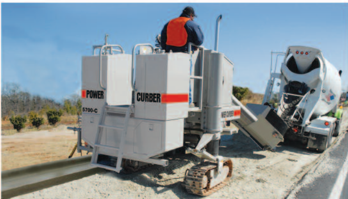
▲ Power Curbers 5700-C & 5700-C-MAX Slip-Form Curb Machines