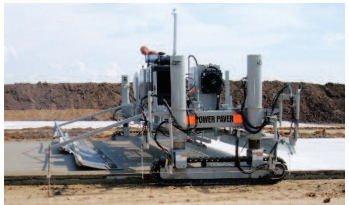
The front drag feature is being used for an astro turf drag while the curing compound is sprayed at the back.

At the front of the machine, the burlap drag with hydraulic lift allows the operator to easily adjust the height of the drag on the go. A water misting system is available for added versatility.