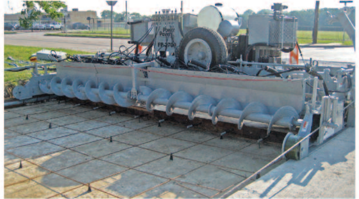
▲ Power Pavers FP-2700 and FP-3000 Form Riding Pavers