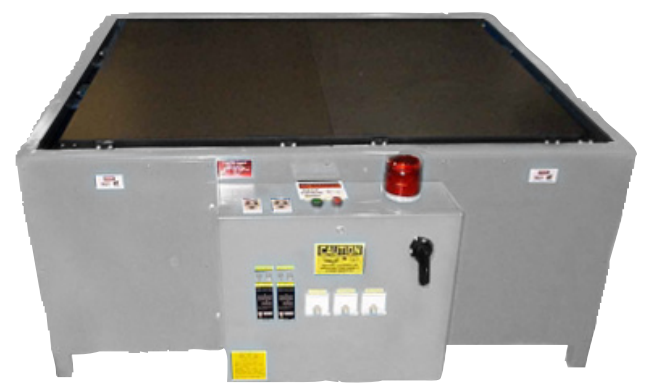
442 Hotplate Table

ADESCOR is committed to designing and building efficient machinery for the most demanding manufacturer. Our equipment meets the highest criteria for reliability and performance worldwide. The ADESCOR design team will assist you in determining if a standard design will meet your requirements or if one of our custom design solutions is needed.