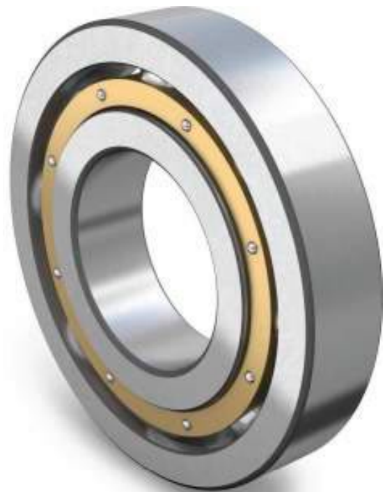
SKF deep groove ball bearing equipped with new brass M-cage