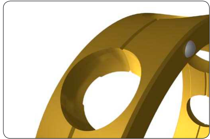
Detailed view of the newly redesigned M-cage pocket

For additional information, contact the SKF application engineering service.