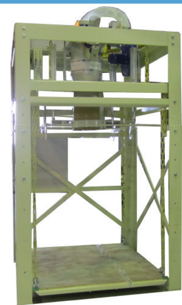
Compact and economical filling unit for different big-bags