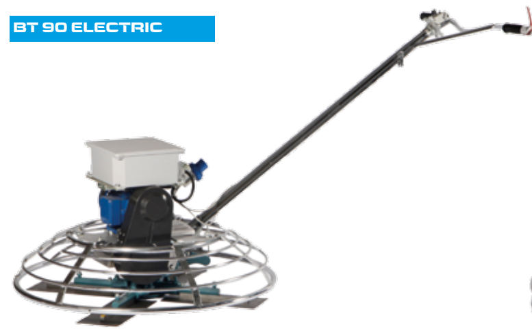
BT 90 ELECTRIC