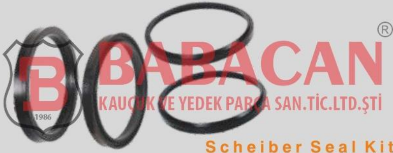
Scheiber Seal Kit Scheiber Keçe Takımı Набор фиберных колец

Serial No : IGM 04151 Original No : Weight (kg) : Size :