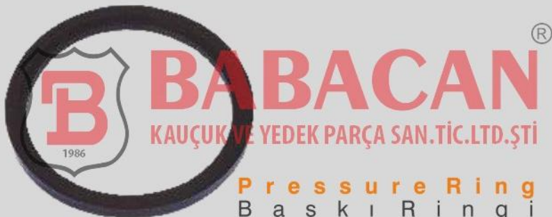
Pressure Ring Baskı Ringi Уплотнение высокого давления