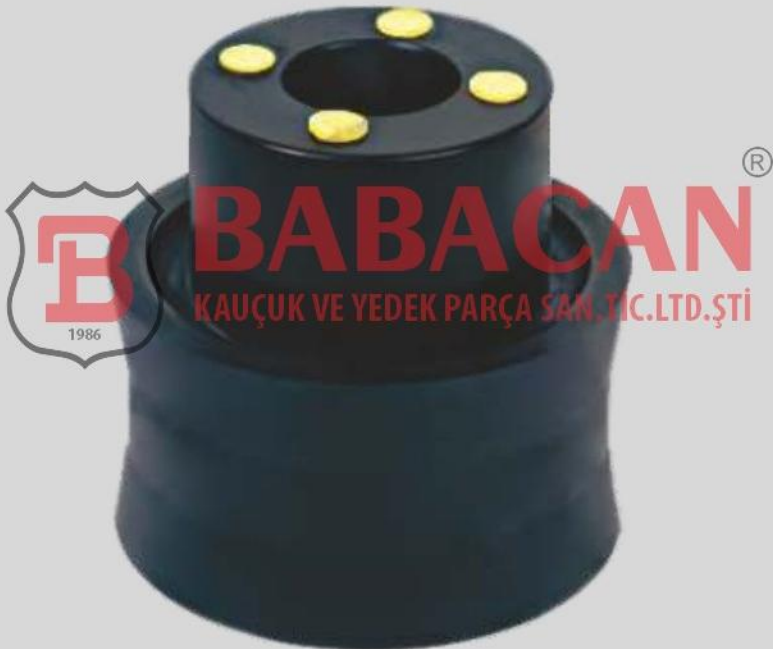
Concrete Pump Piston Beton Pompası Pistonu Поршень для автобетононасоса

Serial No : IGM 04552 Original No : Weight (kg) : 14,7 Size : 200