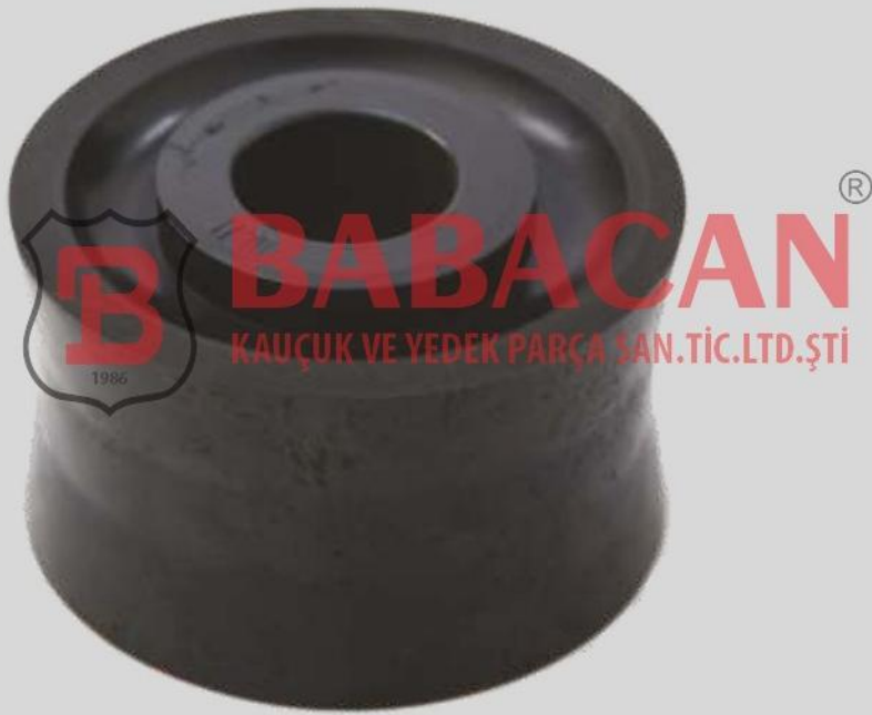
Concrete Pump Piston Beton Pompası Pistonu Поршень для автобетононасоса