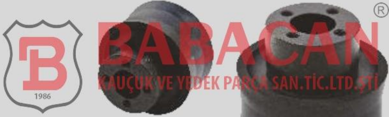
Concrete Pump Piston Beton Pompası Pistonu Поршень для автобетононасоса

Serial No : IGM 04151 Original No : Weight (kg) : Size :