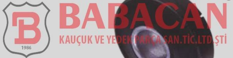
Hanger Mounting Askı Takozu Навесная опора