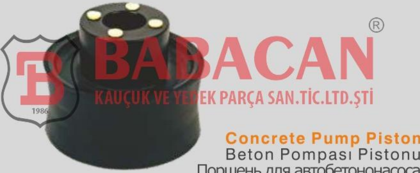
Concrete Pump Piston Beton Pompası Pistonu Поршень для автобетононасоса

Serial No : IGM 04550 Original No : 125067 Weight (kg) : 12,6 Size : 180