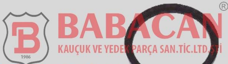
Pressure Ring Baskı Ringi Уплотнение высокого давления