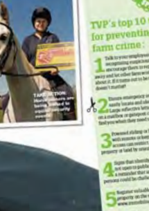
Thames Valley Police is a county-wide force covering an area of 3,000 square miles. It has a reputation for being one of the most innovative and forward-thinking forces in the country.

Thames Valley Police is a county-wide force covering an area of 3,000 square miles. It has a reputation for being one of the most innovative and forward-thinking forces in the country. One of its key initiatives is the Rural Crime Beat, which aims to reduce rural crime through a combination of community engagement, targeted patrols and improved intelligence gathering.