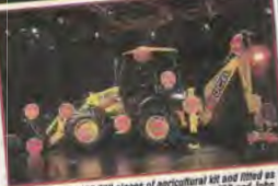
Installed in over 130,000 pieces of agricultural kit and fitted as standard on tractors by manufacturers including JCB and John Deere, the unique CEASAR markings can be checked and approved by police, HPI and DVLA data to check a tractor's provenance.