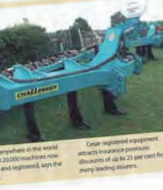
Ceasar registered equipment attracts insurance premiums discounts of up to 20 per cent from many leading insurers.