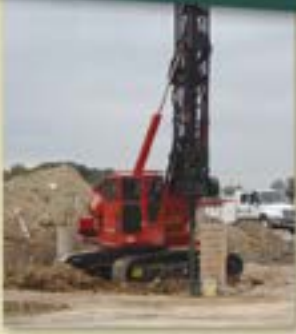
2500CM Short Mast