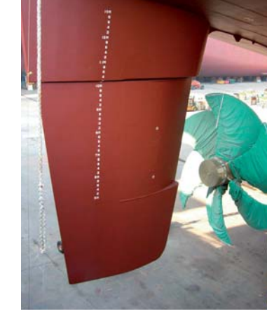
Steering gear with drive