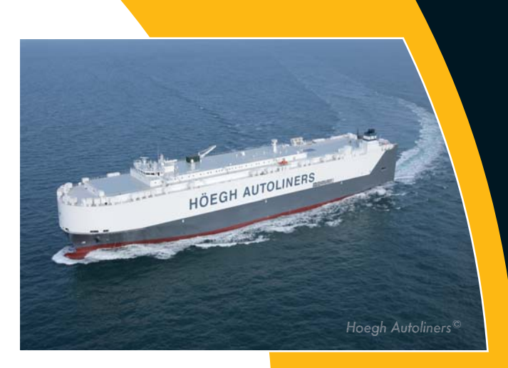
Kuhn shaft covers in steering gear: use in a car transporter

In submarines, finished tubes of up to 7 metres long are used as guide shafts for periscopes and aerials. Kuhn Special Steel produces these tubes using ferrite-free, highly corrosion-resistant alloys. Here too, the products are finished ready for installation including welding, deep drilling, turning and honing.