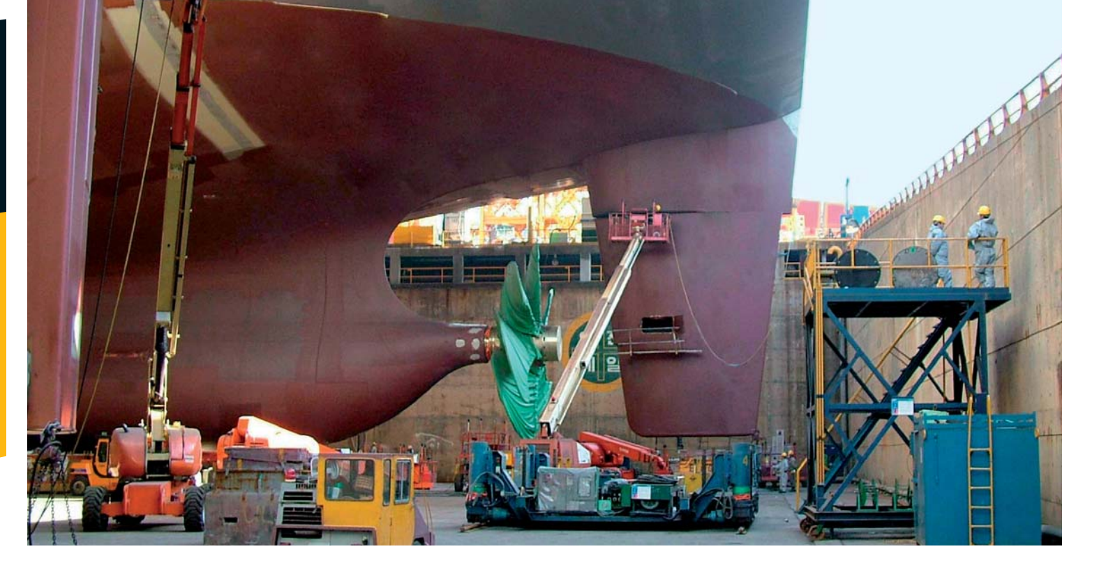
Steering gear of a container ship