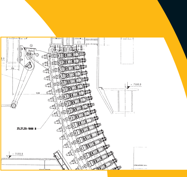
Technical drawing of an extrusion casting line