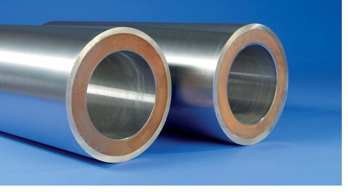
Composite casting rollers: 2 materials - 1 component