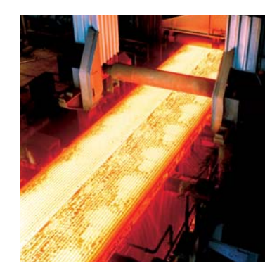
Extrusion casting rollers are produced at Kuhn Special Steel with composite centrifugal casting

You benefit, among other things, from very corrosion- and wear-resistant alloys and from the optimum combination of two different materials for the inner and outer layers of an extrusion casting roller in composite centrifugal casting. Whether it's advice on and development of materials for abrasive use even at over 1,000°C or finishing ready for installation on modern CNC lathes, we have the skills and solutions for you.