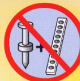
Powder Cartridge + Pins