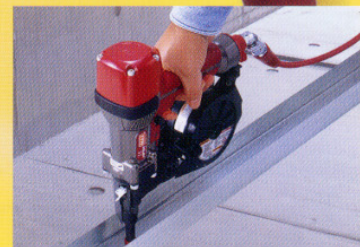
Metal Track to Concrete Ceiling (Ideal Super Light & Compact Tool for Overhead Use)