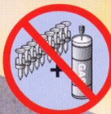
Fuel Gas Cell + Stick Pins