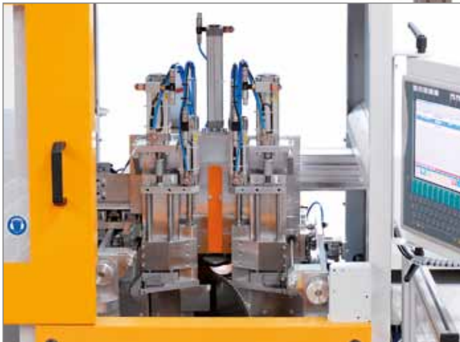
Modular composition clamping- and sawing aggregate