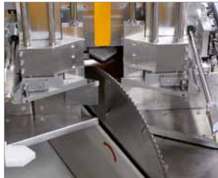
Sawing unit NC-controlled

Operating system Windows with software package ZA 550 for PVC-cut, floppy drive 3.5 inch. CD-ROM drive, machine control through I/O-optical fiber field bus, complete with cabinet. Automatic bar out- feed transport through deportation table or horizontal belt conveyor.