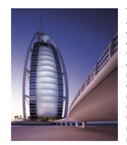
Only the enormous angle of view makes this camera position possible - very close, with a dramatic vanishing-point perspective without cutting off the top of the tower