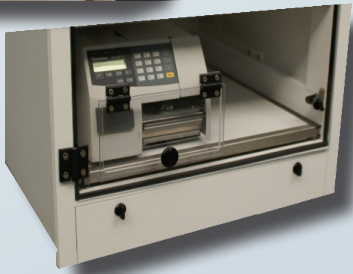
TAV L12 slot