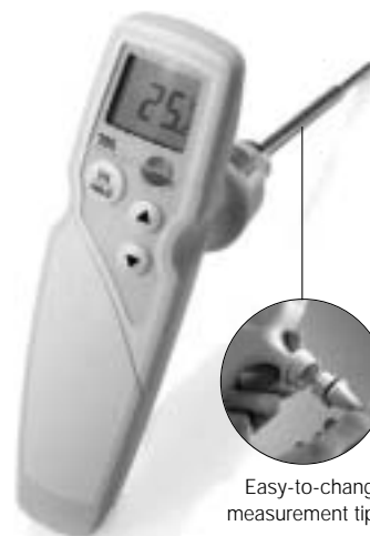
Easy-to-change measurement tips