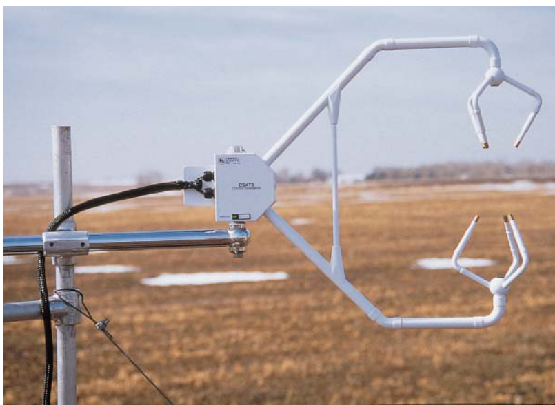
The CSAT3, shown making measurements over a fallow field in Minnesota, provides precision turbulence measurements with minimal flow distortion.