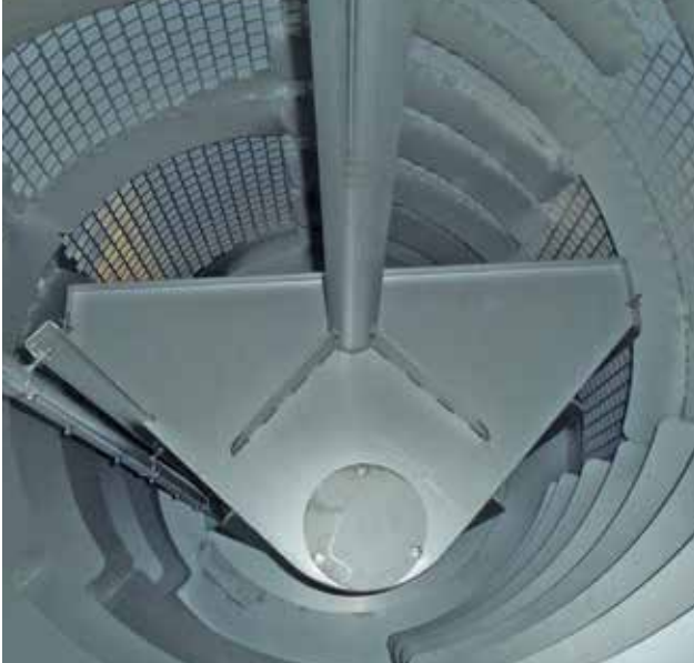
HUBER Drum Screen RoMesh® for optimal separation of very fine particles.