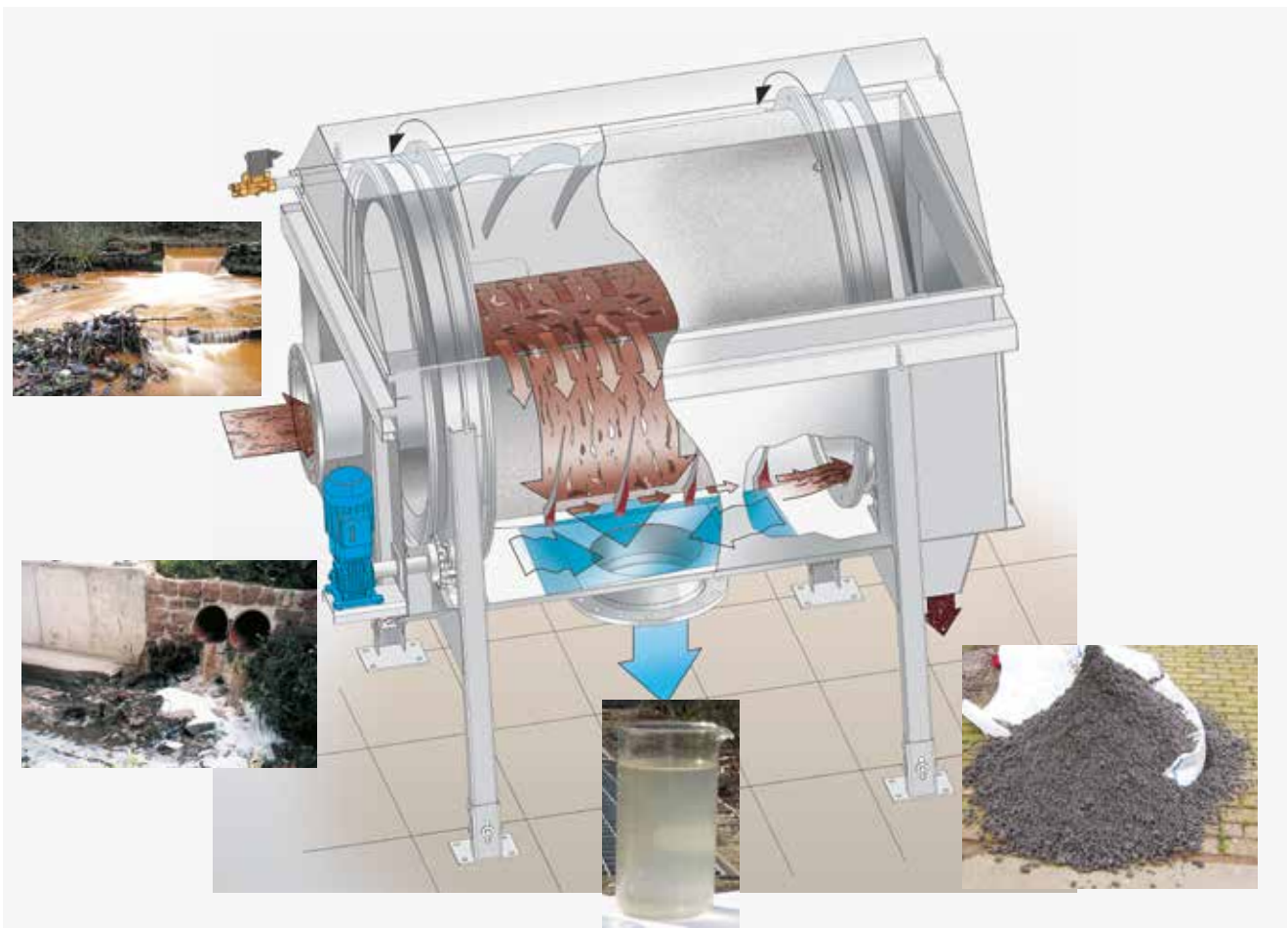
Schematic drawing of the HUBER Drum Screen RoMesh®.