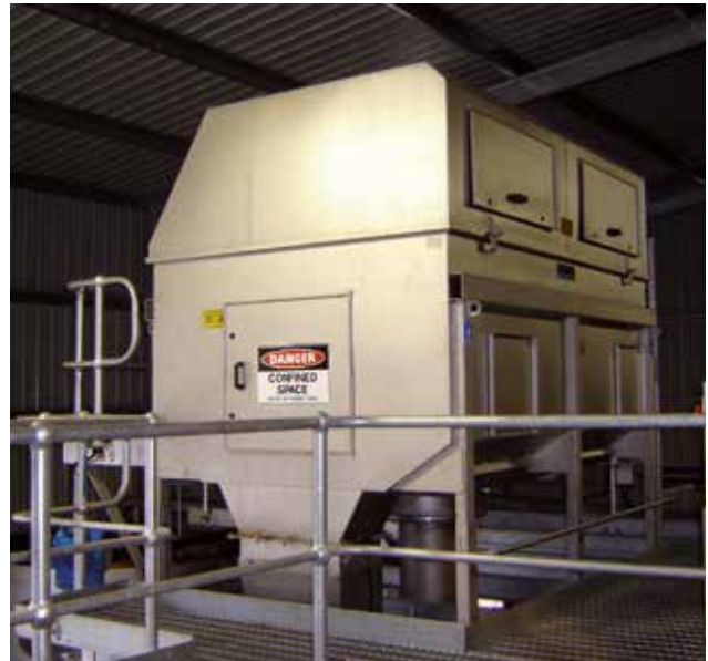
Installation of a HUBER Drum Screen RoMesh® for industrial wastewater treatment.