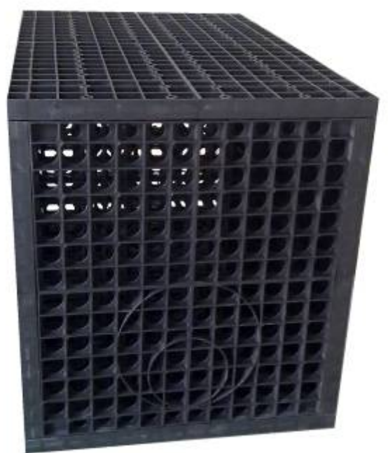
Detail of Hidrobox 1.1 (*)

Hydrobox systems consists of a plastic geostructure of high resistance that allows to install means of collecting rainwater, accumulation and underground transport in a easy and modular way. With an easy assembly, this product accepts a variety of configurations depending on the required resistance.