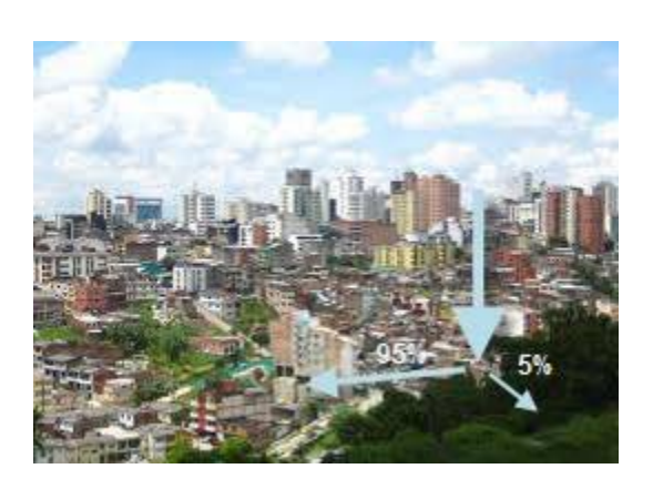
Surface water drainage in urban area

Along the years, the most common practise has been to transfer the water through pipes outside the city. The city courses have been channelled and the sewage networks deigned to collect and transport all the superficial water. Due to this practise, rivers have lost its natural diversity and natural ways to response against flood events, whereas the sewage networks can not absorb the amount of additional water from the new housing developments.