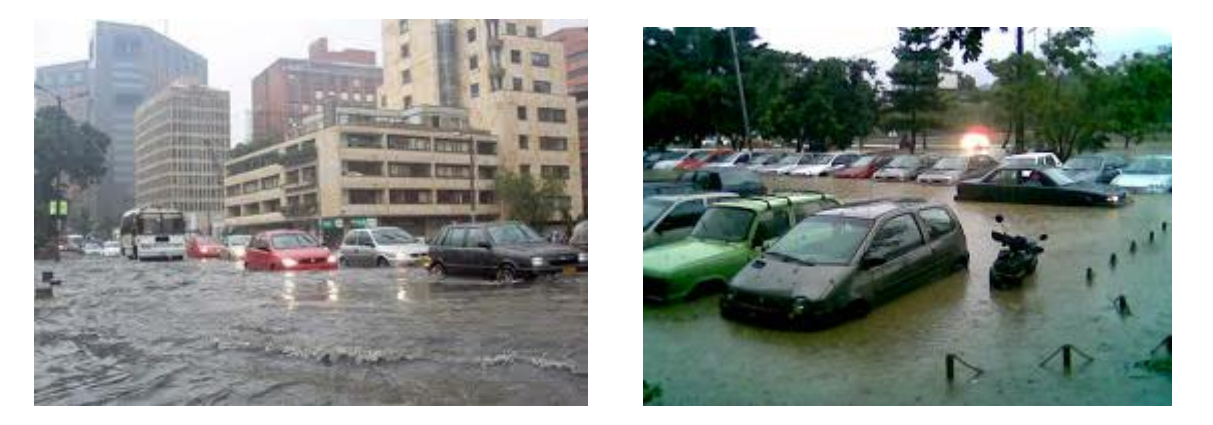
Flood events produced by the inability of absorbing a storm high peaks by traditional means

Along the years, the most common practise has been to transfer the water through pipes outside the city. The city courses have been channelled and the sewage networks deigned to collect and transport all the superficial water. Due to this practise, rivers have lost its natural diversity and natural ways to response against flood events, whereas the sewage networks can not absorb the amount of additional water from the new housing developments.