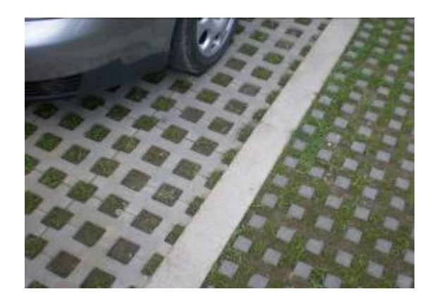
Permeable park site

From the totality of techniques that SUDS include, there is one that rises up above all: the geostructures of geocells modular systems.