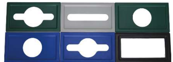
Variety of lid openings & stamping options