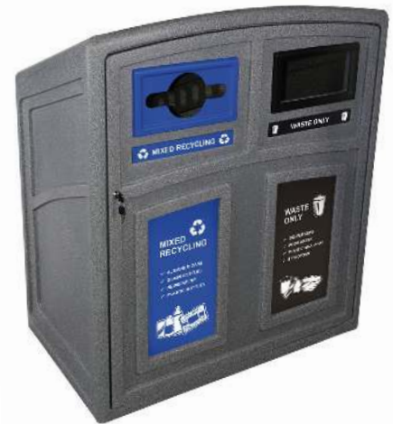
Optional labels available