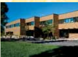
Banner Headquarters Minneapolis, MN USA