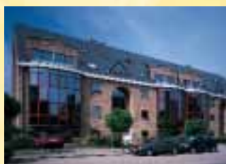
Banner Corporate Office Wommel, Belgium