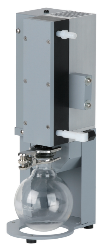
Peltronic Exhaust Vapour Condenser

Peltronic Exhaust Vapour Condenser: Pays for itself within 1 to 2 years!