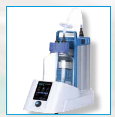
Version with glass bottle - for aggressive media, smaller quantities and quick autoclave