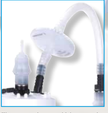
Filter 0.2 micron - high protection against contamination, autoclavable