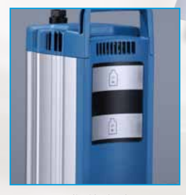
Non-contact liquid level sensor - wearfree, simple bottle exchange