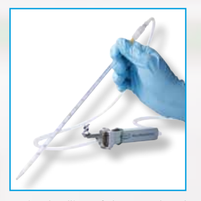
Precise handling of long, graduated pipettes