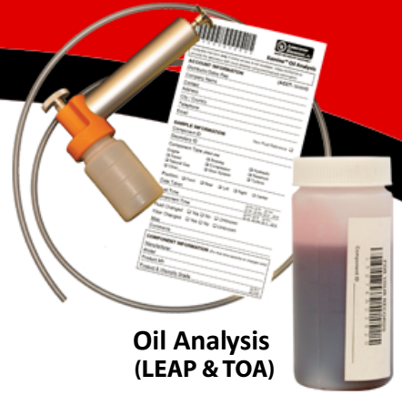
Oil Analysis (LEAP & TOA)