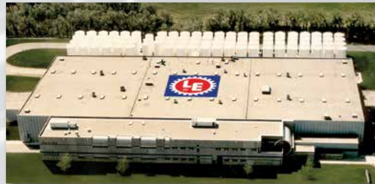
LE's state-of-the-art manufacturing facility and technology center is located in Wichita, KS, USA. Sales, customer service and technical support functions are based in Fort Worth, TX. Our global network of trained lubrication consultants ensures timely onsite assistance after the sale.