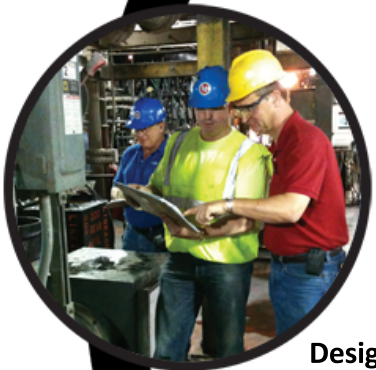
Equipment Reliability Assessment