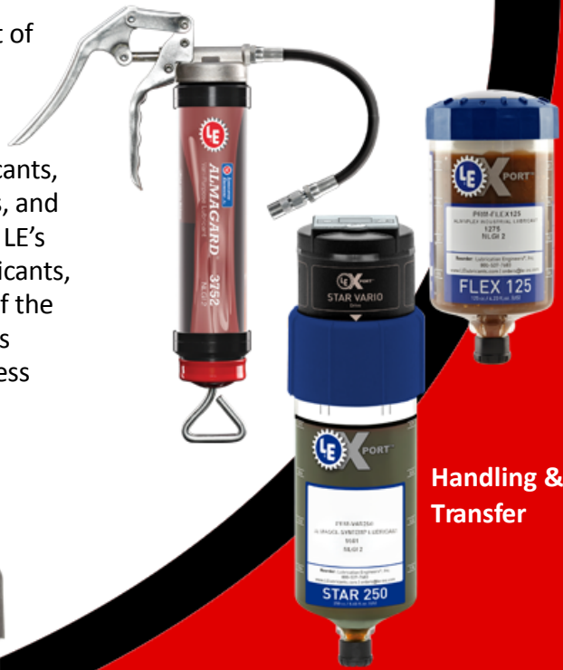
Handling & Transfer