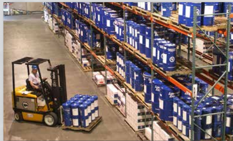
Nearly 60 percent of LE's lubricant orders are on the road the same day we receive them, while 95 percent go out in one day or less. Distribution comes out of Wichita as well as warehouses in Knoxville, TN, and Las Vegas, NV.