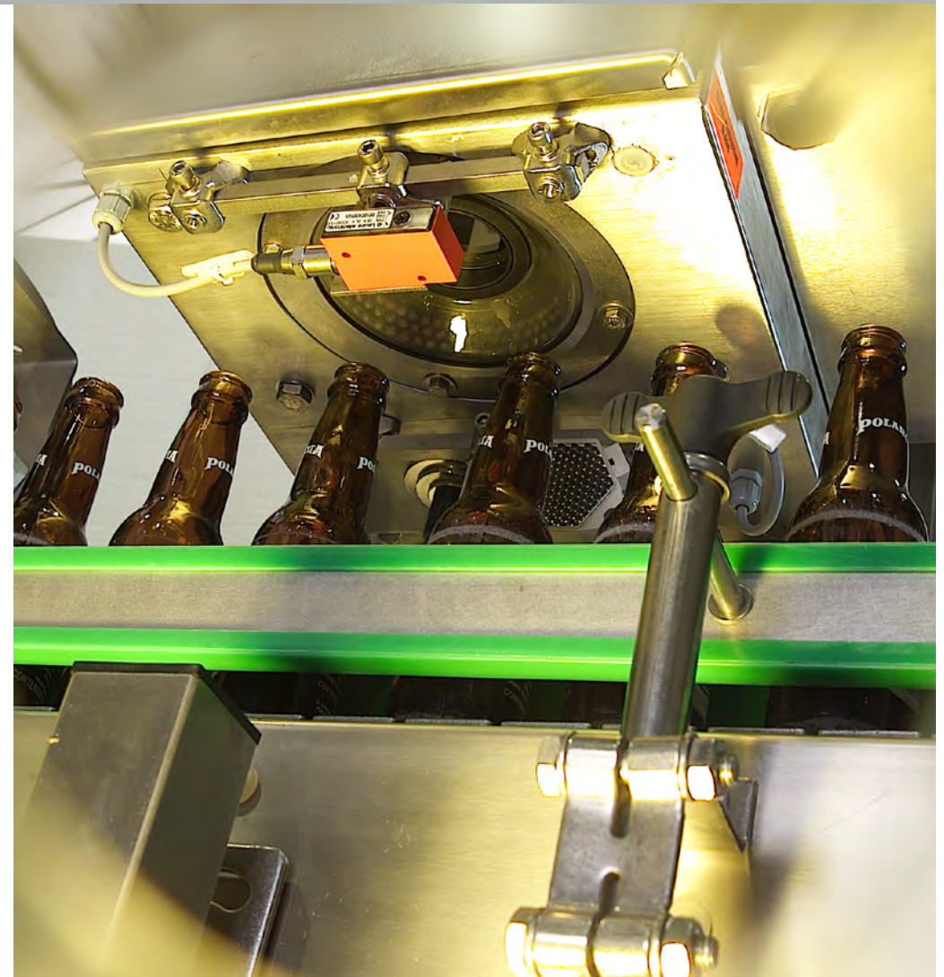
Sealing surface inspection unit