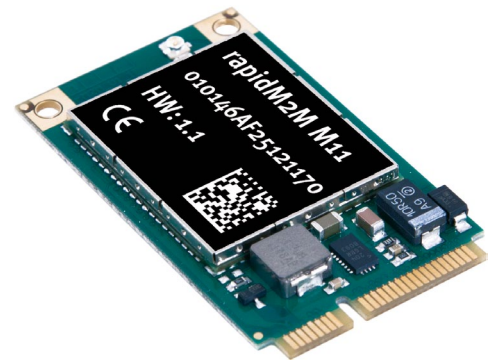
With the technology from Microtronics, data transmission will become an integral part of your products