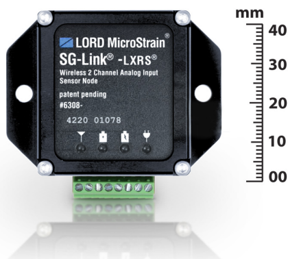
SG-Link ® -LXRS ® - small, low-power two-channel analog sensor node with many sampling options

LORD MicroStrain ® LXRS ® Wireless Sensor Networks enable simultaneous, high-speed sensing and data aggregation from scalable sensor networks. Our wireless sensing systems are ideal for sensor monitoring, data acquisition, performance analysis, and sensing response applications.