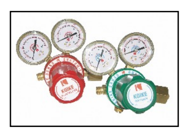
Custom Regulators - Koike's 101 single-stage oxygen regulator and 202 single-stage acetylene and LPG regulators meet the industry needs for compactness and economy. Assure your cutting, welding and heating operations to be safe and effective with Koike custom regulators.

Flashback arrestors are recommended for safe operation. (Refer to accessories under specifications).