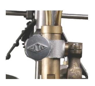
Graduated Bevel Collar