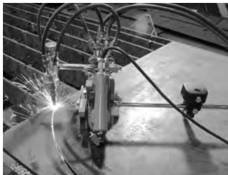
Circular Cutting Attachment